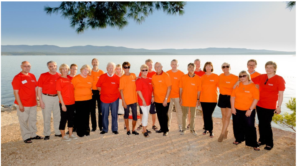
DE delegates from all over Europe gathered in Bol, Croatia 2012