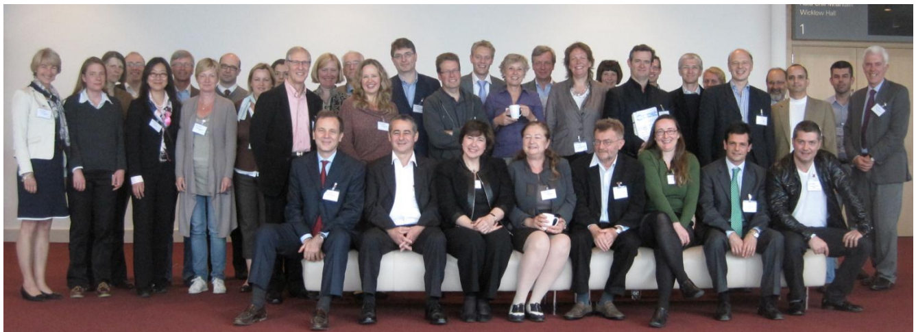
Participants of The European Network for the Study of Dystonia Syndromes gathered before the MDS congress in Dublin for their first meetings.

Among the lobbying and other activities of the European Brain Council (EBC) the main effort currently is to make 2014 the Year of the Brain. This will be an important milestone in the work to help people living with brain illness in Europe. Confirmation of the main activities planned will be available in the early months of 2013.