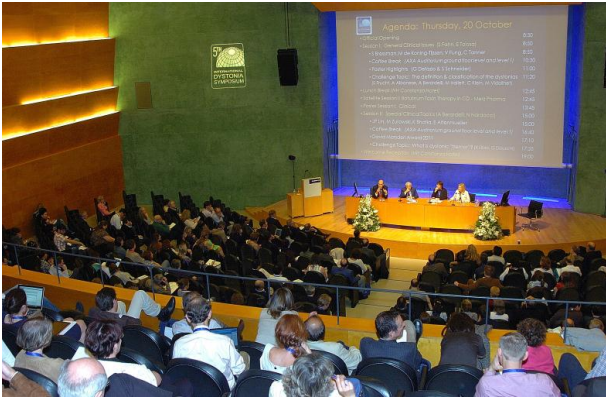
The 5th International Dystonia Symposium, October 2011, in Barcelona

This successful conference was a collaboration between EDF and the Dystonia Coalition, attracting more than 560 participants from 39 countries. They included a mix of researchers, clinicians, medical students and physiotherapists. Several dystonia patient organisations from the US and EDF funded scholarships for young researchers to be able to participate. The scientific programme included 53 speakers with sessions over three days. Over 100 posters were displayed, with details of the latest studies on dystonia. It was the biggest international scientific event solely on dystonia ever to have been held anywhere in the world. Its success is already stimulating even greater interest in dystonia among scientists in many countries and has brought the dystonia community even closer together. All of this can only push forward research on dystonia and the possibilities for faster results in improving treatments and finding a cure.